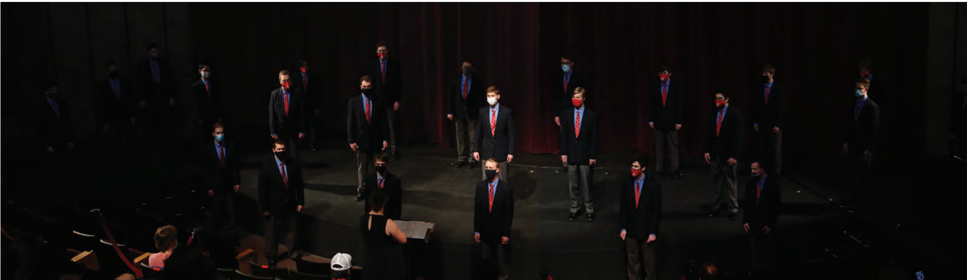
The final Glee Club performance of the semester saw the likes of “Old Wabash,” “Alma Mater,” and Billy Joel all in one show.