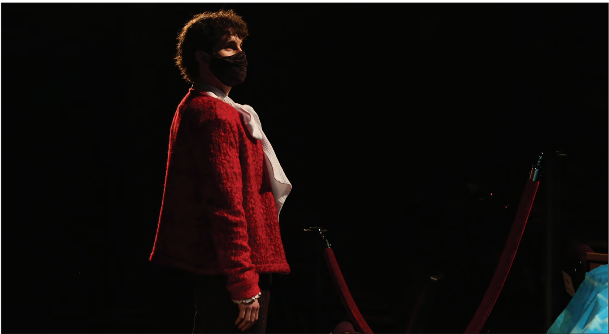
BENJAMIN HIGH '23/PHOTO

The fashion show consisted of five different looks with five different models who used the Ball Theater as their very own walkway.