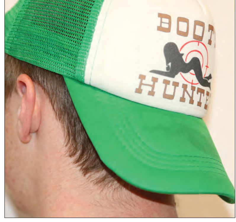
Our dashing editors rocked some gear freshly picked up from the local thrift store.