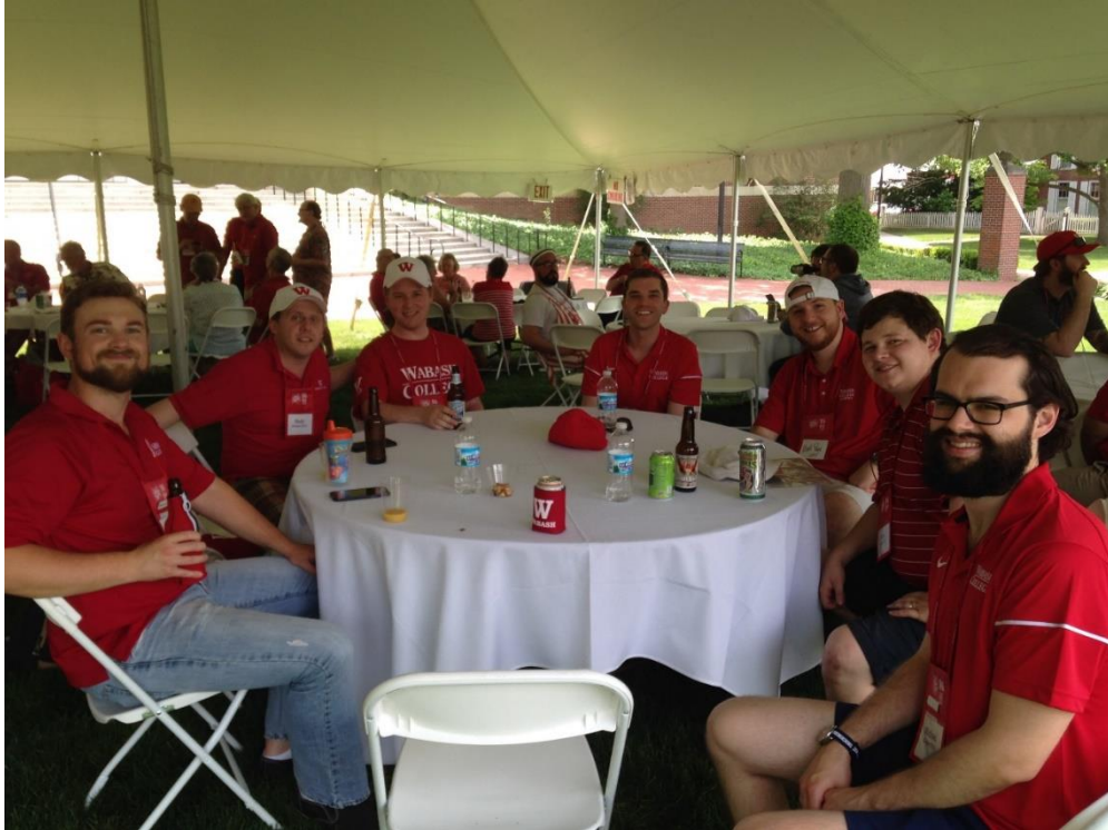
Some Members of the Class of 2013 Enjoying a Break