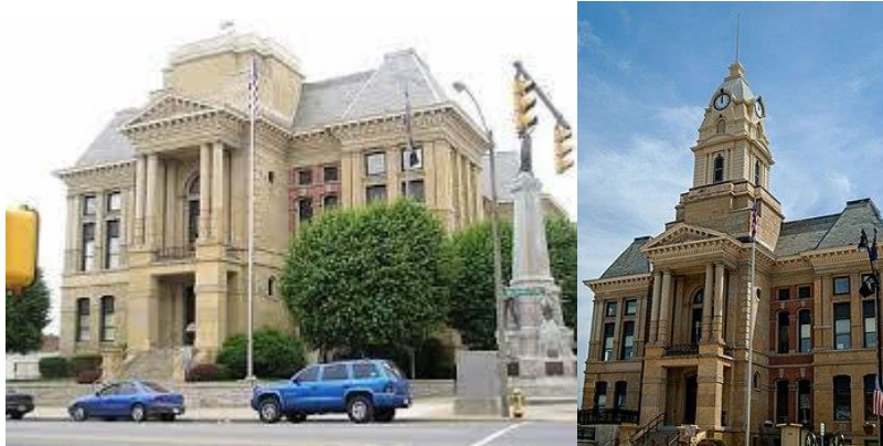
BEFORE - Without the clock