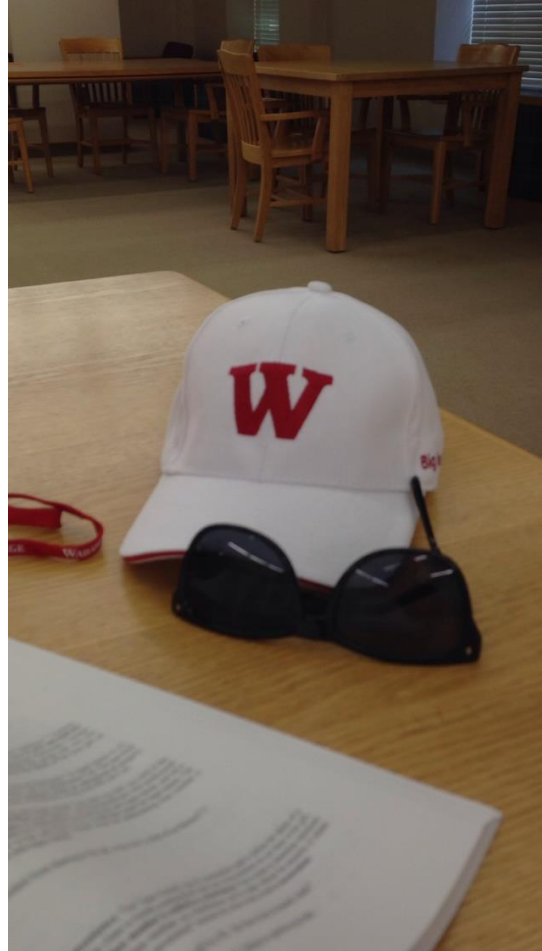
Free Hat with Every Registration

On the morning of the second day, some enterprising members of our class participated in the Bike Ride and the poorly named “Fun” Run. Following the completion of the run and bike ride, representatives from each class participated in a Chapel Sing contest. Hearing the different versions of the song’s second verse proved the highlight of the event. Some classes even choreographed their cheating by hiding the lyrics to the second verse behind their backs or in their hats. Our Class won 3 rd place during the event. This isn’t saying much considering many of the classes participating probably got DQ’d for cheating.