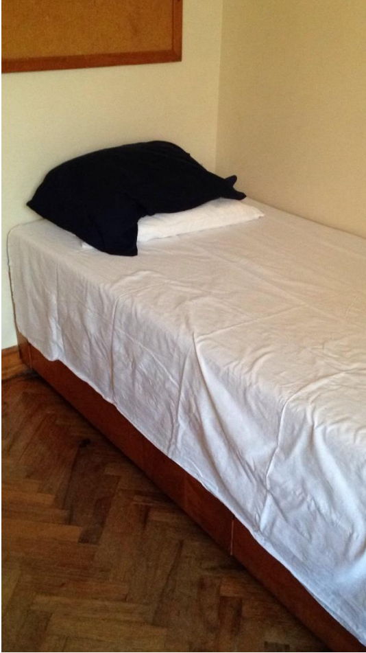
Spacious Accommodation in Morris & Wolcott