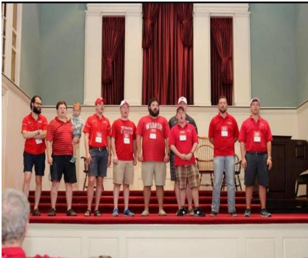
Competing in Chapel Sing Competition