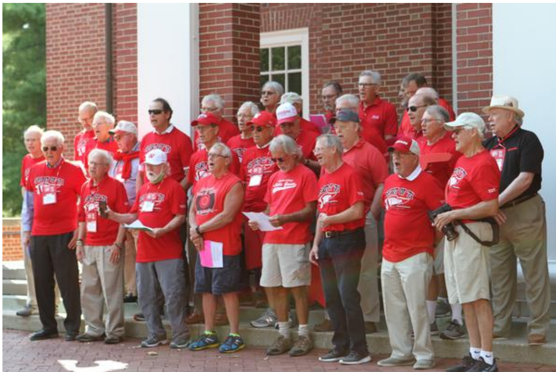
The Class of 1971 sings on the steps of the Chapel.