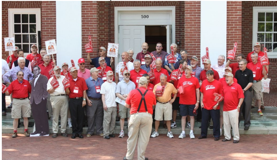
The Class of 1971 Sings Old Wabash At Its 40 th Reunion.

If the story is about you, it will probably be about all of us. For example, one classmate wrote about a question-and-answer exchange at oral comps. It was about him, but it was about all of us who took comps. Your trivia is meaningful.