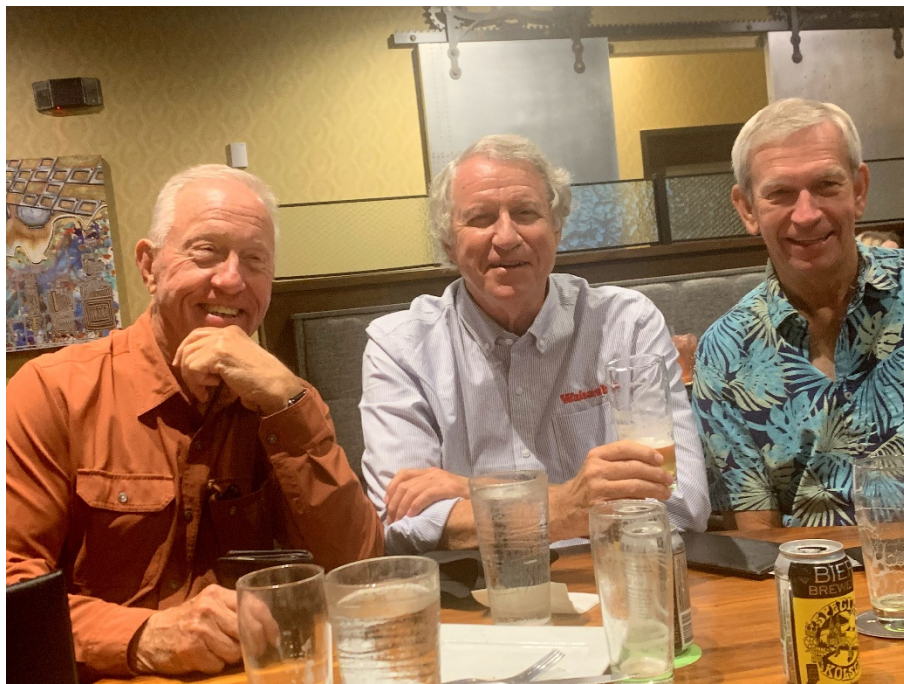
Phi Delt quorum at Homecoming.