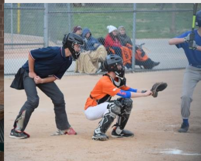
Varsity pitcher and umpire!