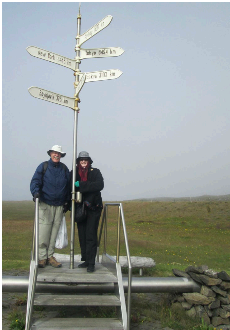
Standing (pre-pandemic) at the Arctic Circle on the Icelandic out-island of Grimsey.