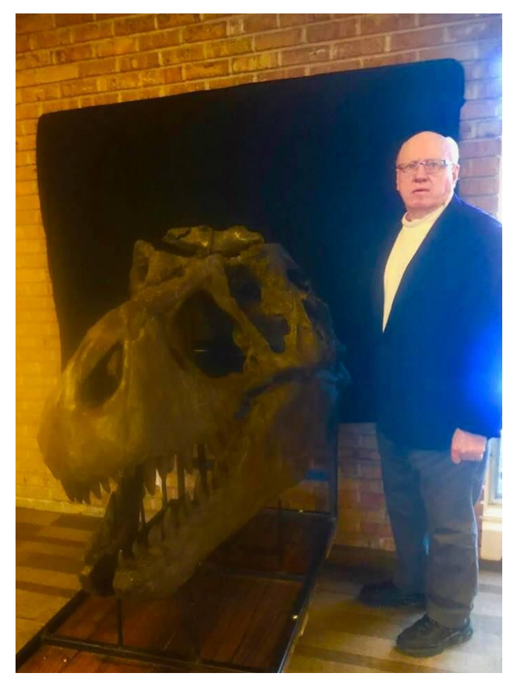
02-11-19 And where would we be without a Mike Dybel enigmatic photo? Photos?