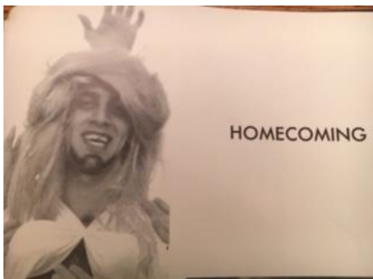
Homecoming '64, from the '65 yearbook