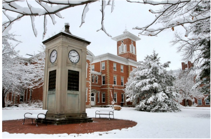
Winter arrives on campus