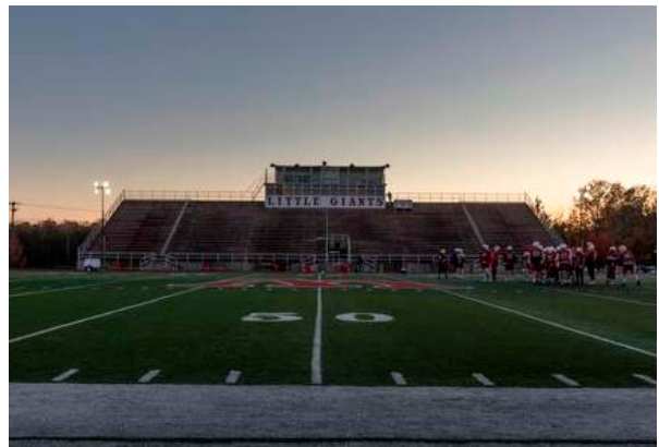
Photos from the last football practice in Hollett Little Giant Stadium