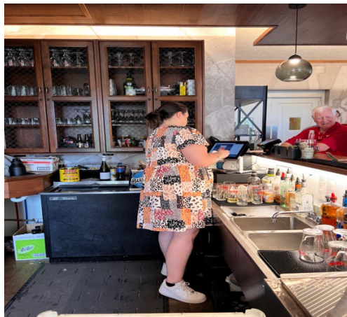
Sparks Center has a pub. It is called "Wally's". This was arguably the most popular person on campus this weekend serving up TWR and other refreshments to many a thirsty Wally.