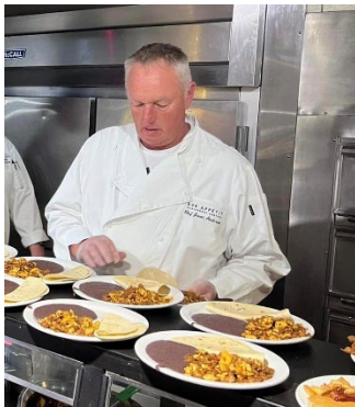
Coach makes sure his team is well fed before the game

It has been an exciting fall with gorgeous sunny skies to watch the Little Giants in their brand new stadium on Frank Navarro field. And the North Coast Athletic League champion will be whoever wins the Monon Bell