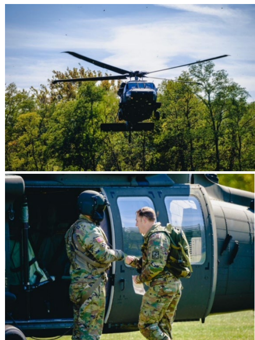
Blackhawk helicopter landing to pick up Wabash men to attend training @ Purdue ROTC.