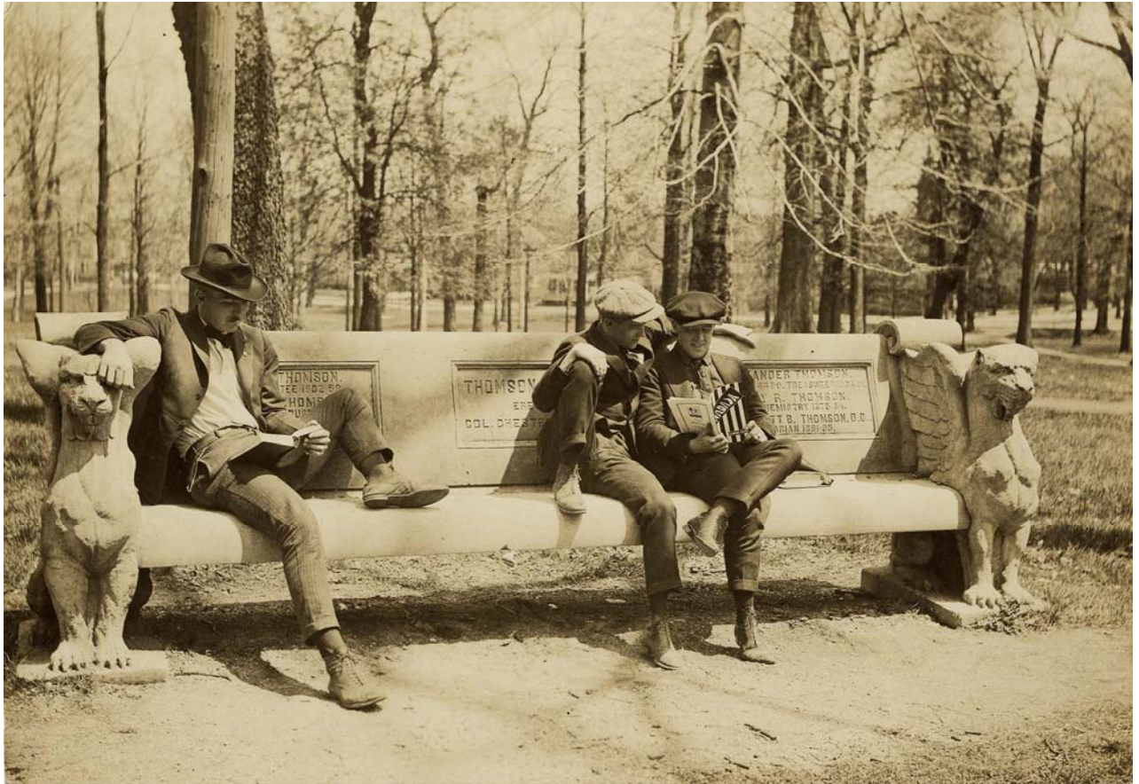
Three seniors enjoy a leisurely read on the Thomson Bench, known to generations of Wabash men as the Senior Bench. The two men on the right are reading the November, 1916 issue of the Wabash Magazine.

The Bench almost immediately became the sole province of the Senior Class. Woe to the lowly who dared to sit on the sacred bench. The photo below shows members of the Class of 1916 enjoying the privileges of their recent elevation. Also shown are the inscriptions now lost beneath hundreds of layers of paint. The Senior Bench sits at the center of the campus and painting it is a key tradition for generations of Wabash Men.