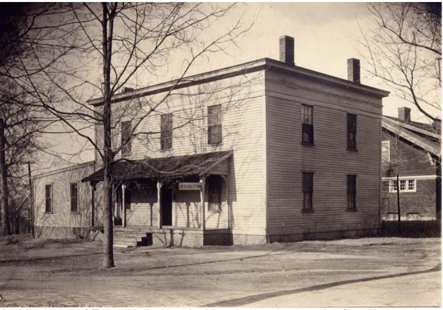
In this picture of Forest Hall, taken in the 20's, the sign hanging from the porch advertises the Scarlet Inn.

The Scarlet Inn in the lower level of the Sparks Center is a place where students, faculty and staff gather, have a cup of coffee, or a sandwich, and discuss the large and small affairs of the College. While the Inn has been a part of the Wabash tradition for nearly a century, it has had a number of different forms and locations. The first Scarlet Inn started with a few enterprising students who needed a way to pay their college expenses. They leased a room in Forest Hall from the College and late in the evening they delivered sandwiches to the fraternity houses. As students do, these men graduated and the Scarlet Inn was defunct.