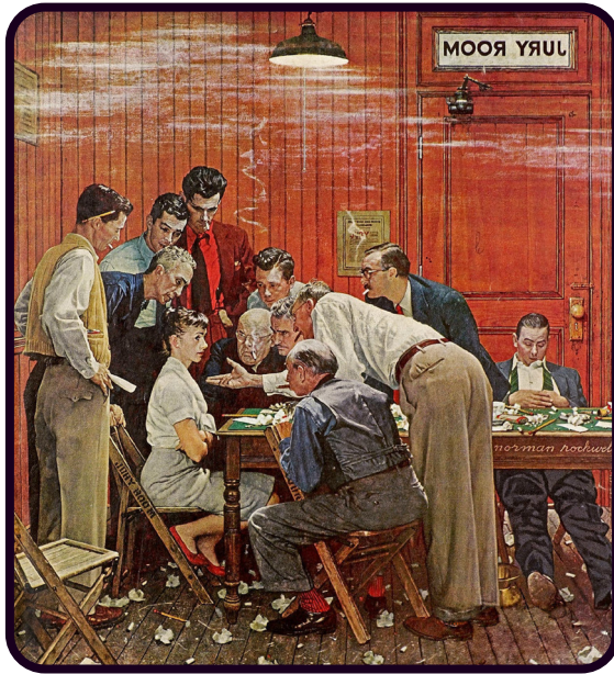
“The Jury” Norman Rockwell, 1959

Produced by special arrangement with THE DRAMATIC PUBLISHING COMPANY of Woodstock, Illinois