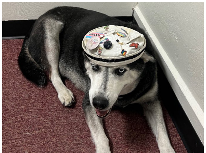
Honorary Fellow Myah wearing a pot during a Friday office dogs visit in the Armory