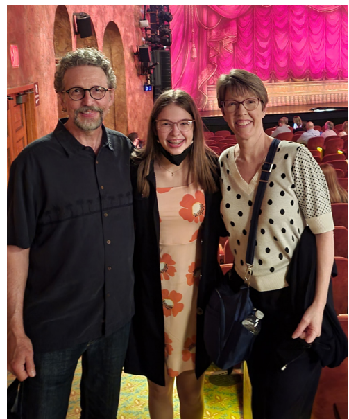
The Abbotts look forward to watching Funny Girl on Broadway