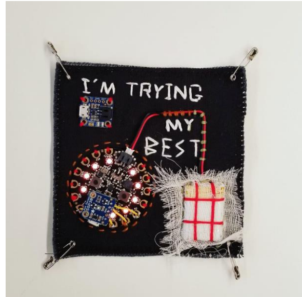
Examples of P@tch Workshop Creations to track CO2 use.