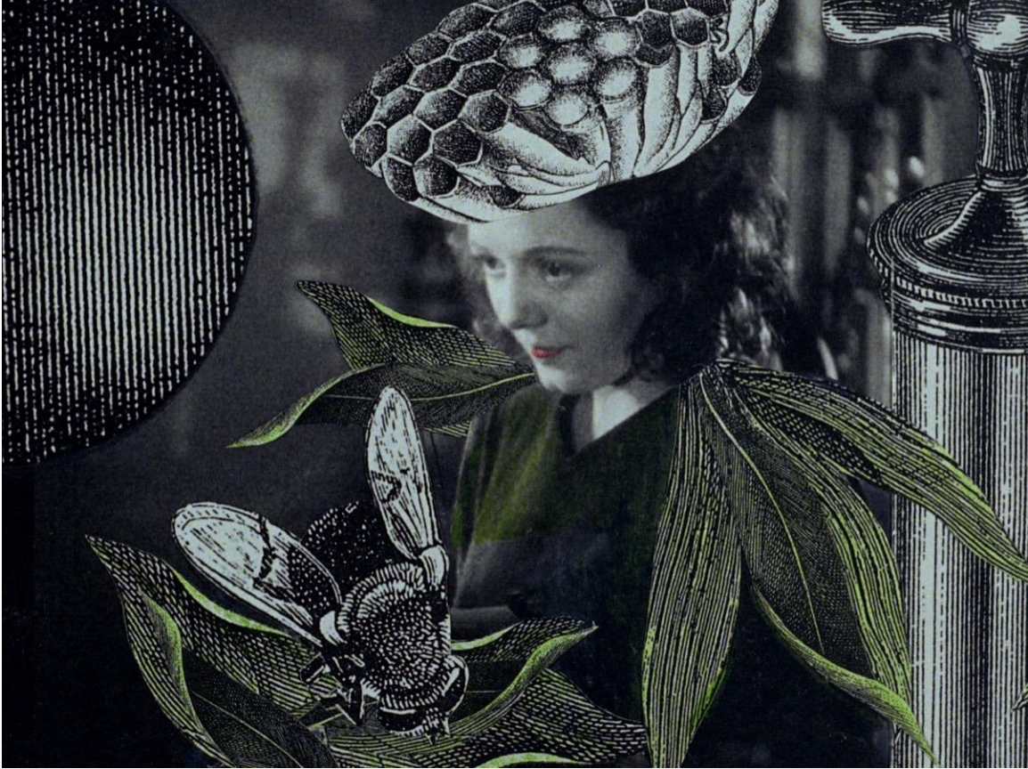
Stacey Steers, Still from Edge of Alchemy , 2017