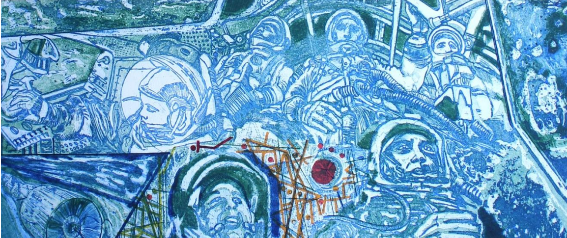
Rudy Pozzatti • Detail from APOLLO • colortrail proof • 1970

Opening Reception: Friday, September 14, 4:30-6:00 pm, Eric Dean Gallery