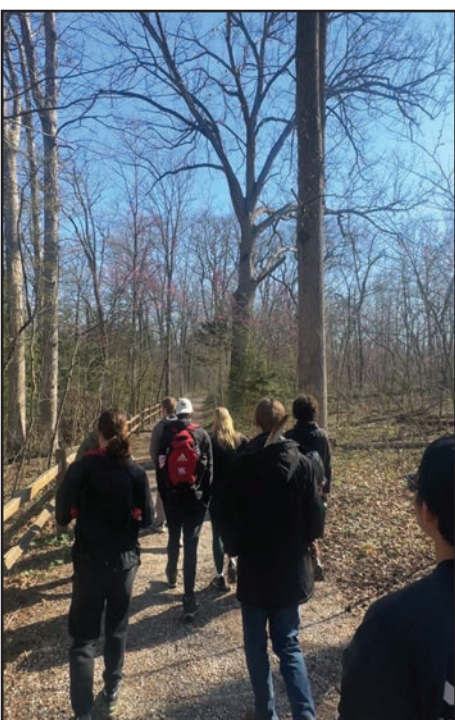
Members of the outdoorsmen club go on a peaceful hike this past spring.

One more thing I would like to add: I know that Wabash gets stressful and puts you down, but don’t fret, there is hope. One way that you can ease that stress is to get off campus and go immerse yourself into nature. The Wabash Outdoors Club does exactly that! If any of this mountain activity talk has gotten you excited, then I have something that might interest you: On October 11th, the Outdoors club will be going on a trip down to Turkey Run where we will be kayaking down Sugar Creek. If you are interested at all, shoot me an email! I love nothing more than to share my love of the outdoors with my