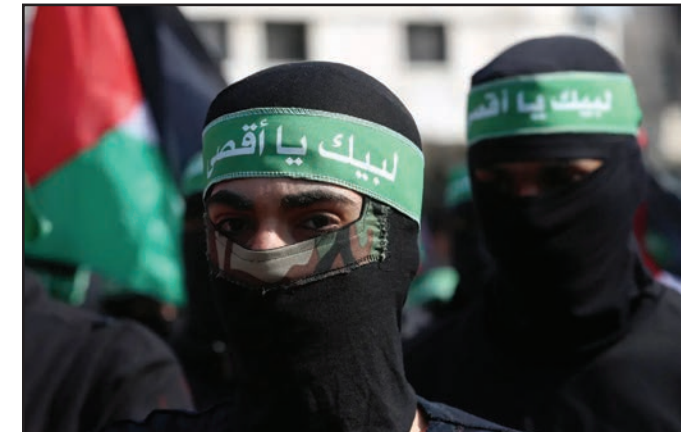
A masked member of Hamas in Gaza City on February 21, 2020.

Israel-Hamas peace deal ends Israeli occupation, sets path for Palestinian statehood