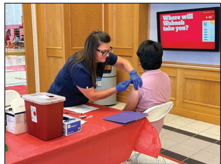
A nurse administers a flu vaccine to a Wabash student on September 30, 2025, in the Allen Center.