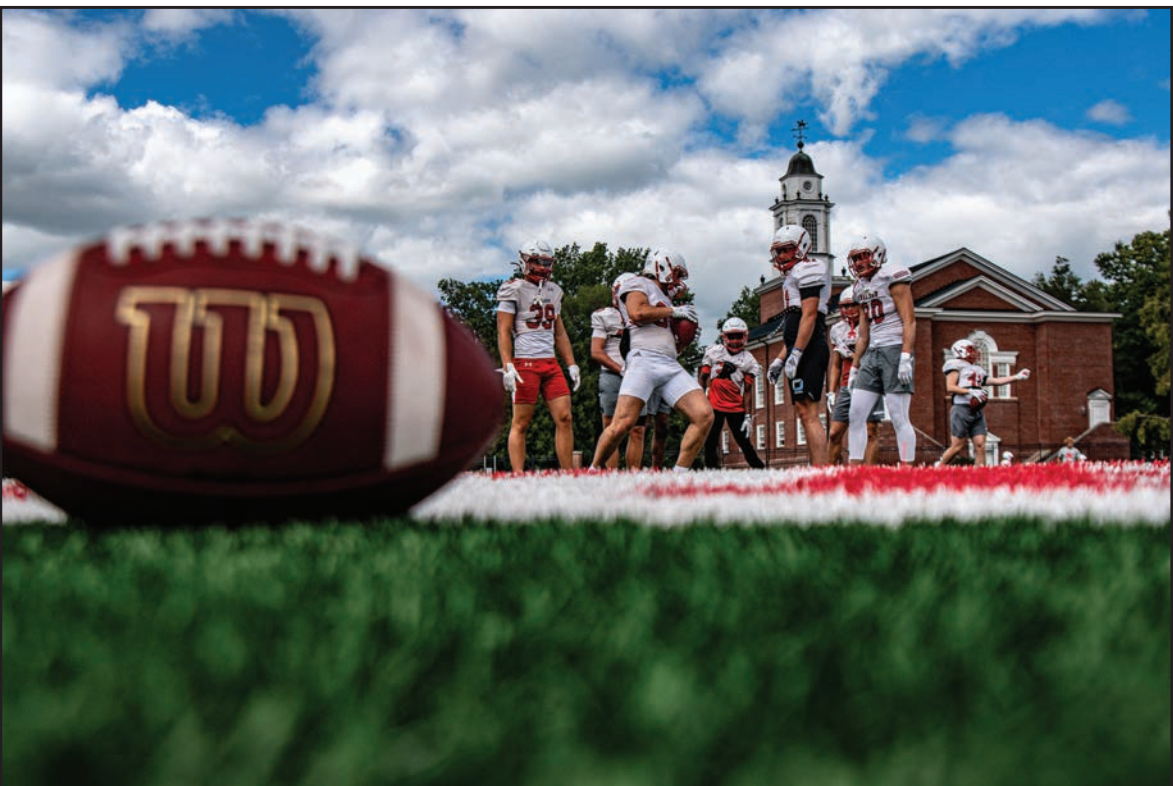
Members of the Wabash College football team complete a drill during practice on August 25, 2025, at Little Giant Stadium.