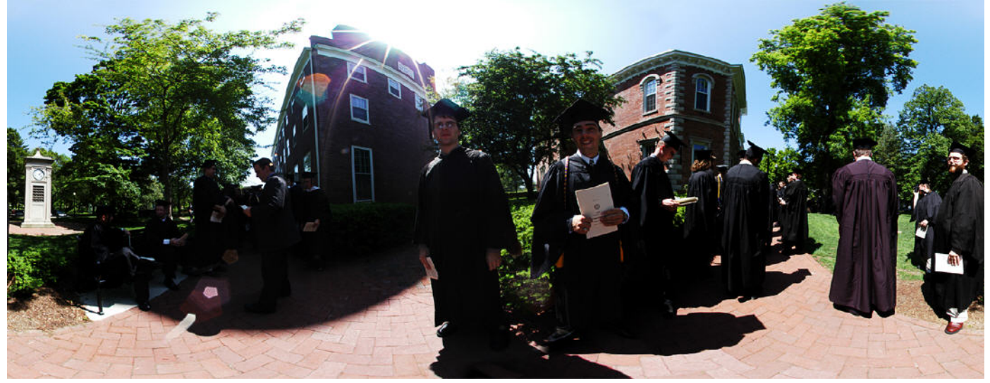
A perfect day for Commencement Services

2:20 PM 16 May 2004 Graduating Seniors line up to march in Commencement Ceremonies.