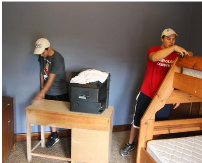
Pledges from Beta Theta Pi participating in Wabash Day while wearing their signature hats