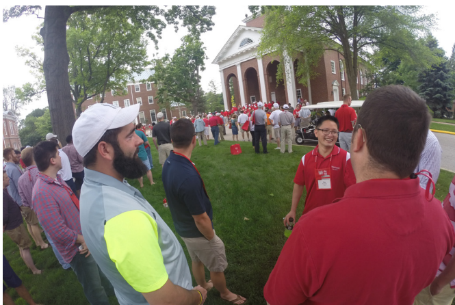
Waiting for our turn to sing