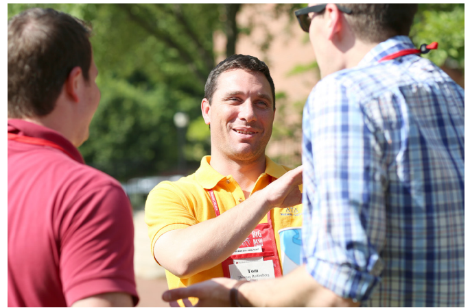
Chatting on the lawn