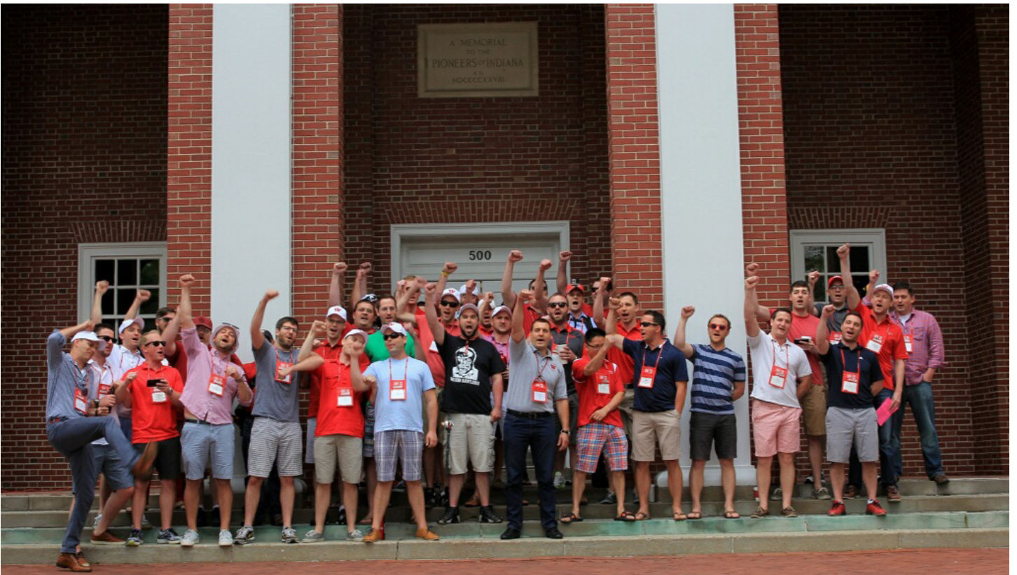
Winning Chapel Sing! (Yeah, we had some hard core spirit!)