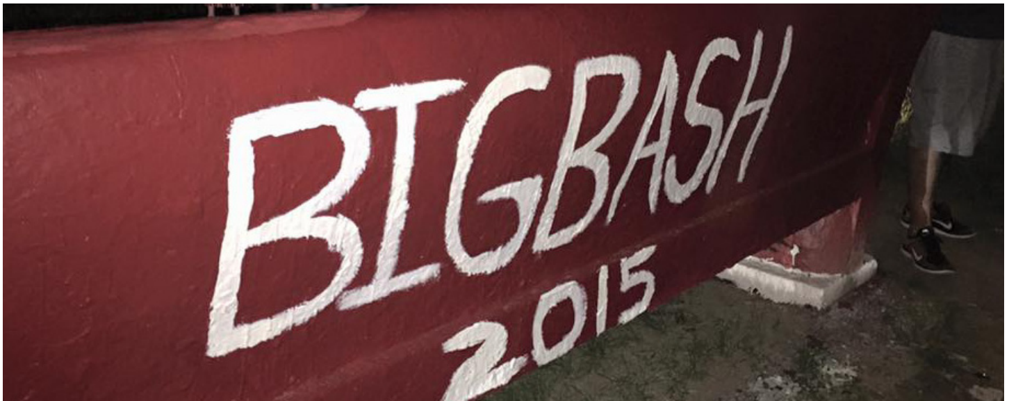
Painting the Bench