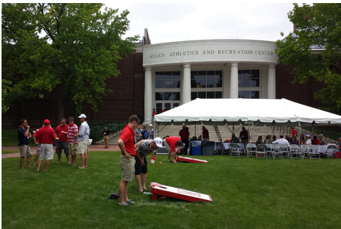
Games & day drinking