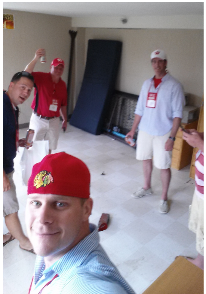
Selfies & more day drinking