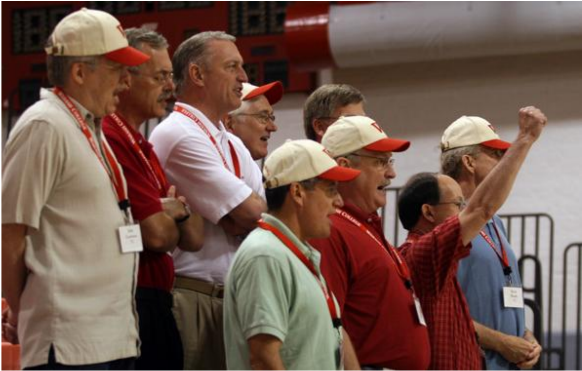
Chapel Sing Competition