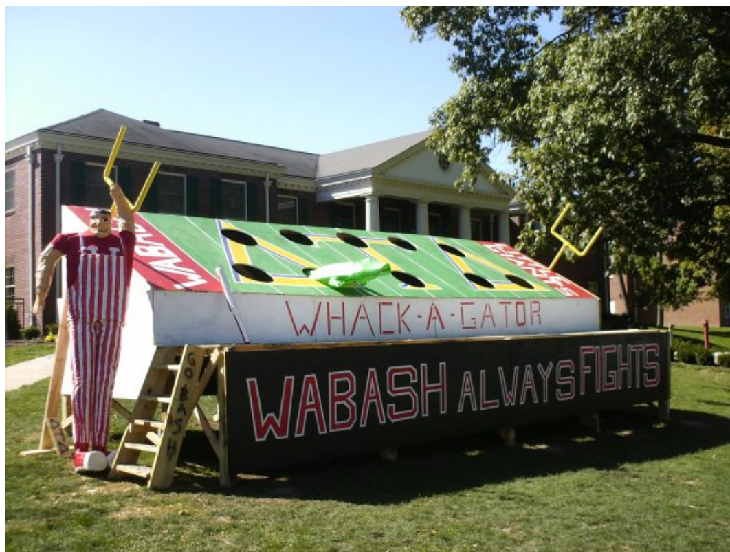
Delta Tau Delta and their “Whack-a-Gator” Homecoming display

You’ll recall that in our day, we faced having a “W” shaved in our hair for failing to be word-perfect when singing the song. Today’s freshman receives a “W” spray painted on his t-shirt (as seen on the student in the bottom left of this photo)