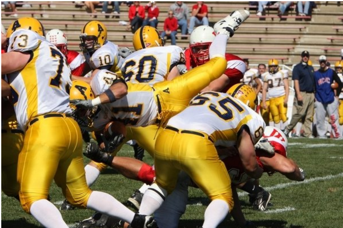
Wabash over Allegheny ~ 48-7!

I was told by members of the football team that during warm-ups # 76 from Allegheny deliberately disrespected us by spitting on the "W" at mid-field. The Little Giants hammered it home all afternoon that it probably wasn't something he should have done.