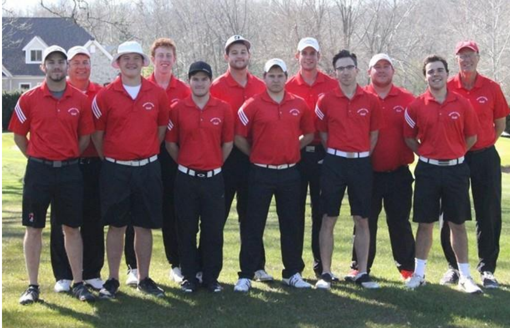
The Wabash golf team earned All-Academic Team honors from the GCAA after posting a 3.1 cumulative GPA.