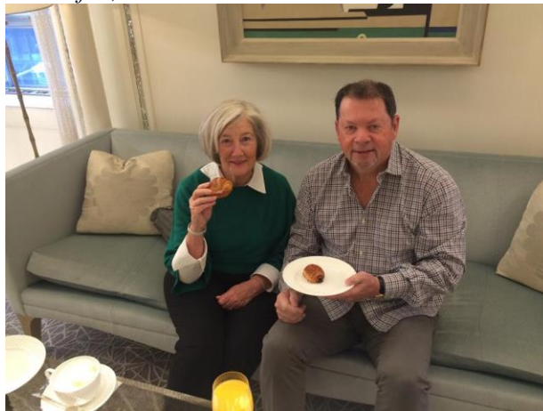
Breakfast at Tiffanys.