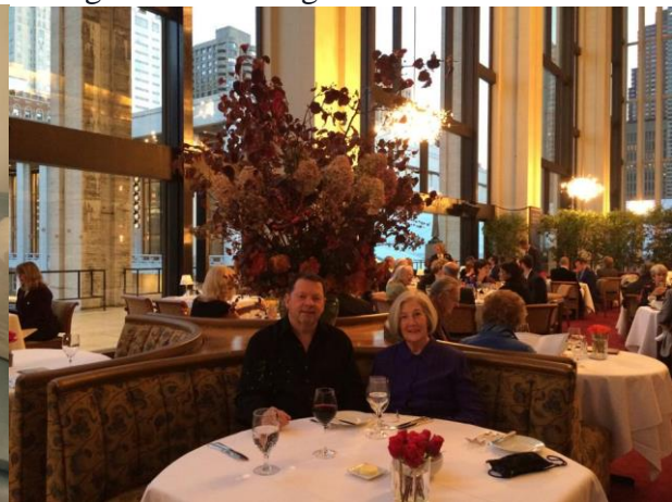
Dinner at the Met.