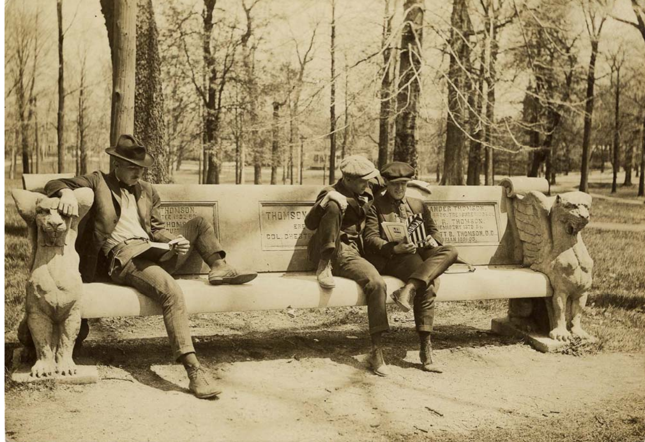
Three seniors enjoy a leisurely read on the Thomson Bench, known to generations of Wabash men as the Senior Bench. The two men on the right are reading the November, 1916 issue of the Wabash Magazine.

The Bench almost immediately became the sole province of the Senior Class. Woe to the lowly who dared to sit on the sacred bench. The photo below shows members of the Class of 1916 enjoying the privileges of their recent elevation. Also shown are the inscriptions now lost beneath hundreds of layers of paint. The Senior Bench sits at the center of the campus and painting it is a key tradition for generations of Wabash Men.